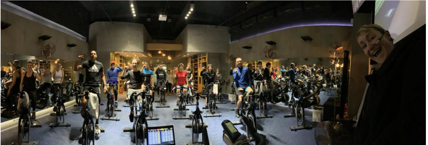
Many Rotarians and friends participated in the Ride to End Polio at the Spinback studio to help eradicate the disease for good. It was a full house turnout.